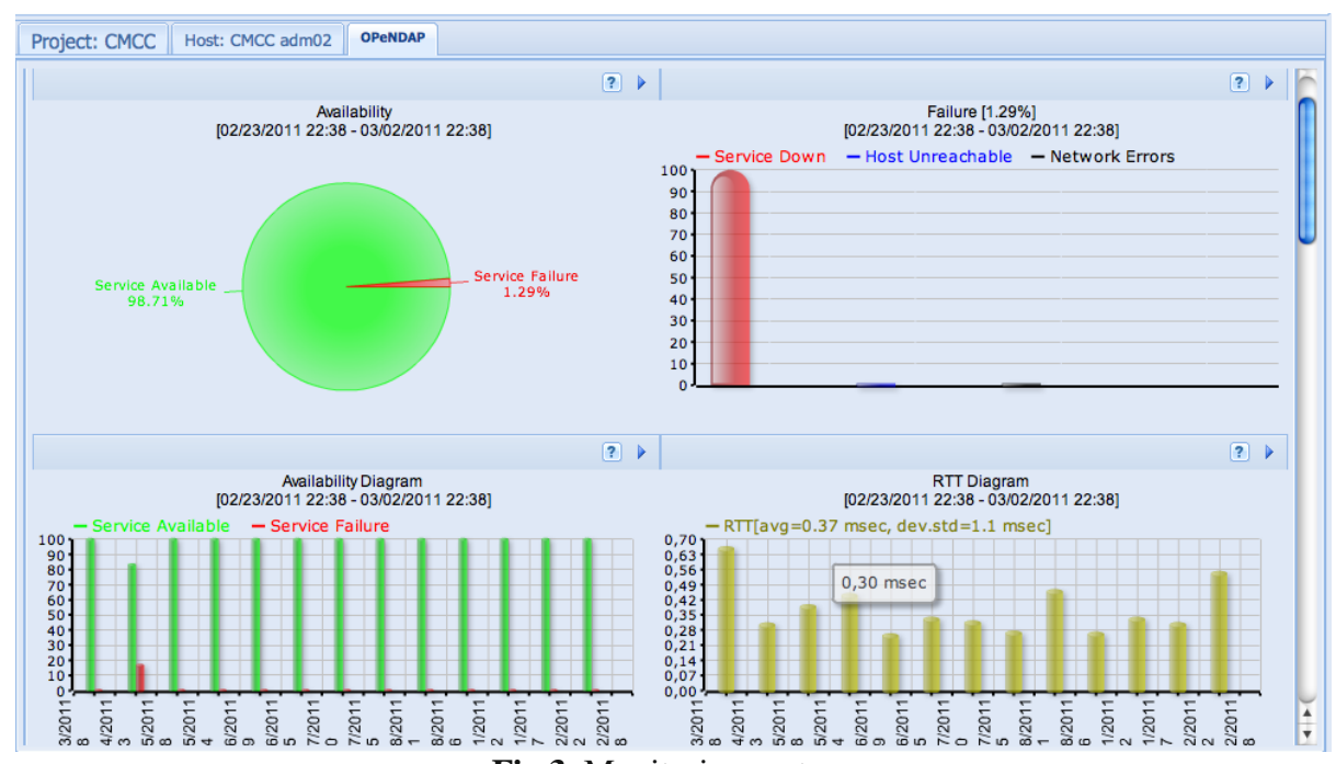
Fig 3. Monitoring system

From a monitoring point of view, the Dashboard system will provide a "service dashboard" (see Fig. 3) with several charts and reports about the service availability, round trip time from a central CMCC location, other useful statistics and data summaries.