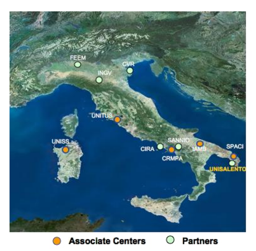
Fig 1. CMCC partners and associate centers

The University of Salento (UNISALENTO in Fig. 1 - Italy) is the ICT-partner of CMCC and in a synergic and strategic way, several courses at the University of Salento, strongly address topics like data management, data mining, parallel computing and distributed systems which are of interest for CMCC and represent the proper ICT foundations to work in the climate change area as a computational scientist. Moreover, several Bachelor, Master and Ph.D. thesis are related to ICT topics in this challenging geoscience field.